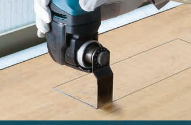
Deep plunge cutting