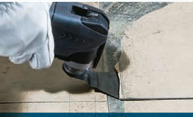
Scraping floor tiles