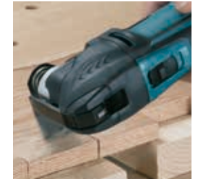
Fully 360° multi angle setting enables users to position accessories in 12 dif erent angles (each 30°) to allow access to tight spaces for optimum maneuverability.

Items of standard equipment may vary by country or area.