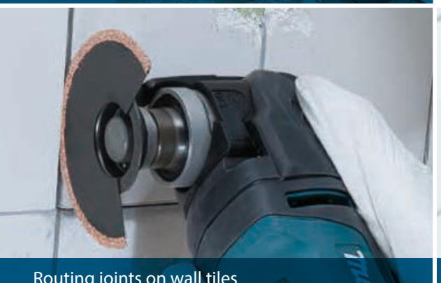
Routing joints on wall tiles