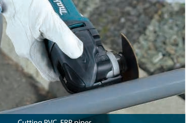
Cutting PVC, FRP pipes