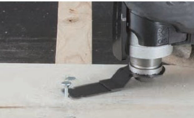
Flush cutting of nails